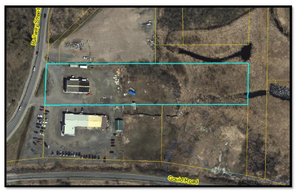
File No. D14-22-03, to change to change the zoning of the subject properties from "ML" Light Industrial Zone and "R2" Residential – Second Density Zone with a "HL" Hazard Land Zone overlay and an "EP" Environmental Protection Zone overlay, to "GC" General Commercial Zone with a "HL" Hazard Land Zone overlay and an "EP" Environmental Protection Zone overlay