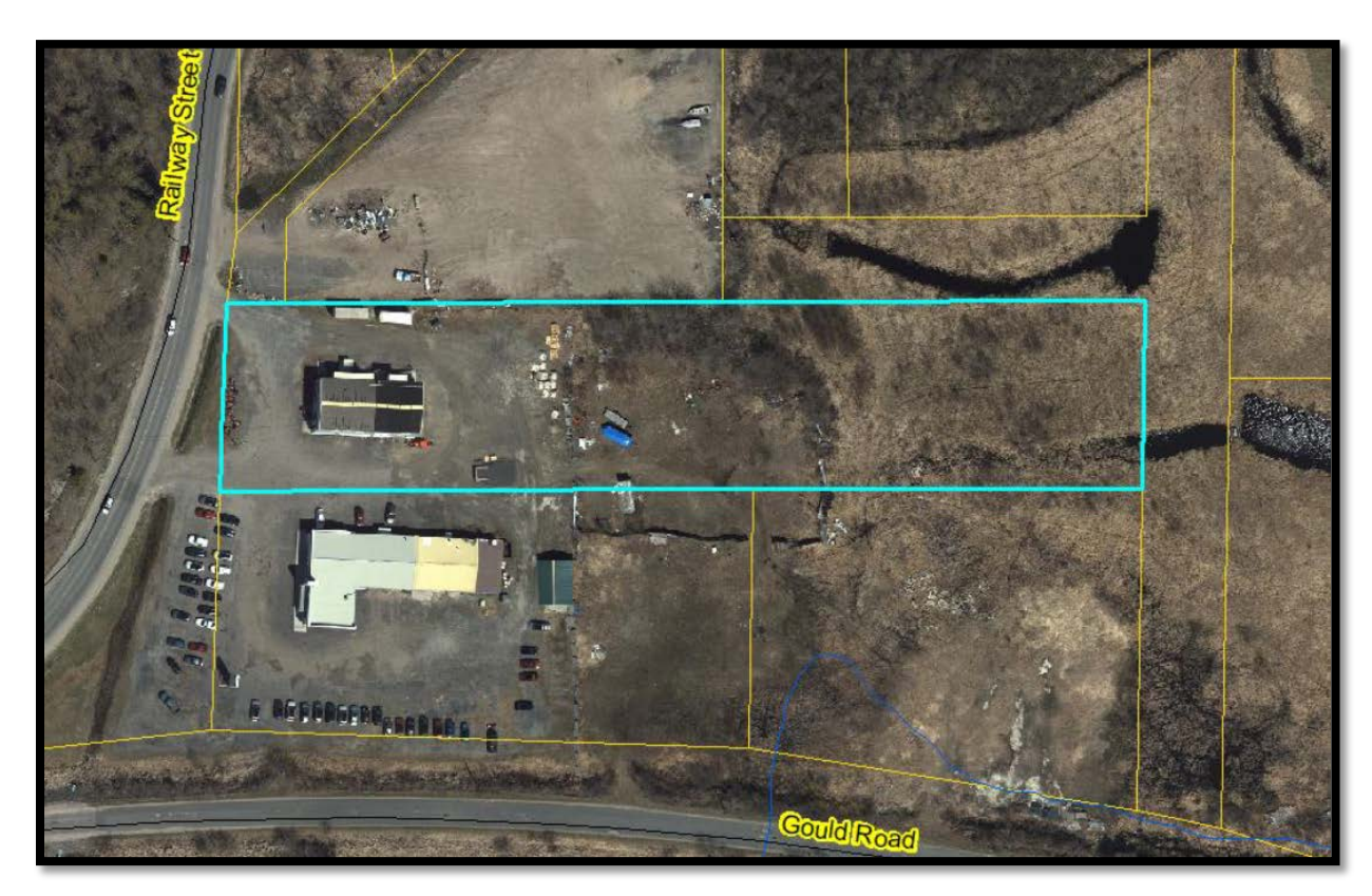
Figure 1: Subject property.

structure to a recreational (fitness) facility, which has been identified by the Agent as a possible future use. Upon approval, Section 1.10 of the Zoning By-law will apply, being applications for building permits are required, per the Ontario Building Code Act and Ontario Building Code , in addition to all other relevant policies in the Official Plan, Zoning By-law, and Site Plan Control By-law.