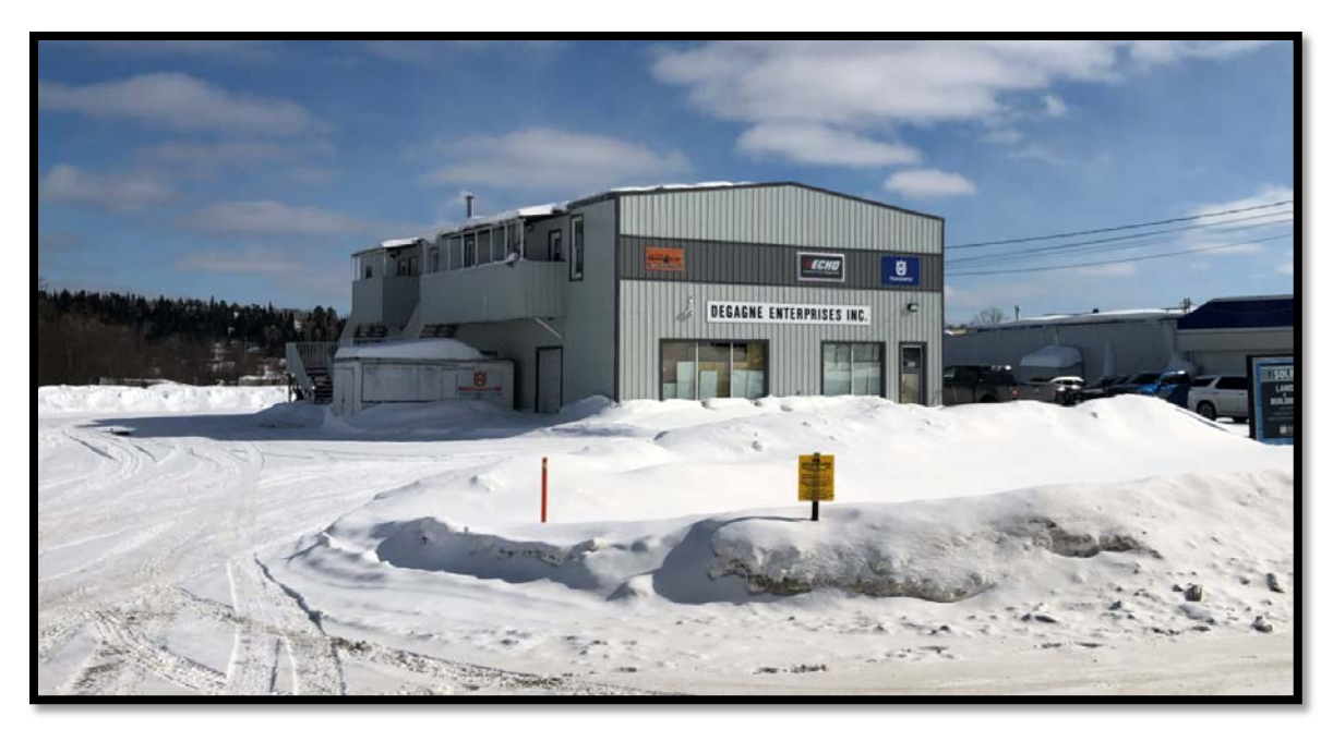
Figure 2 – View of property from Railway Street.