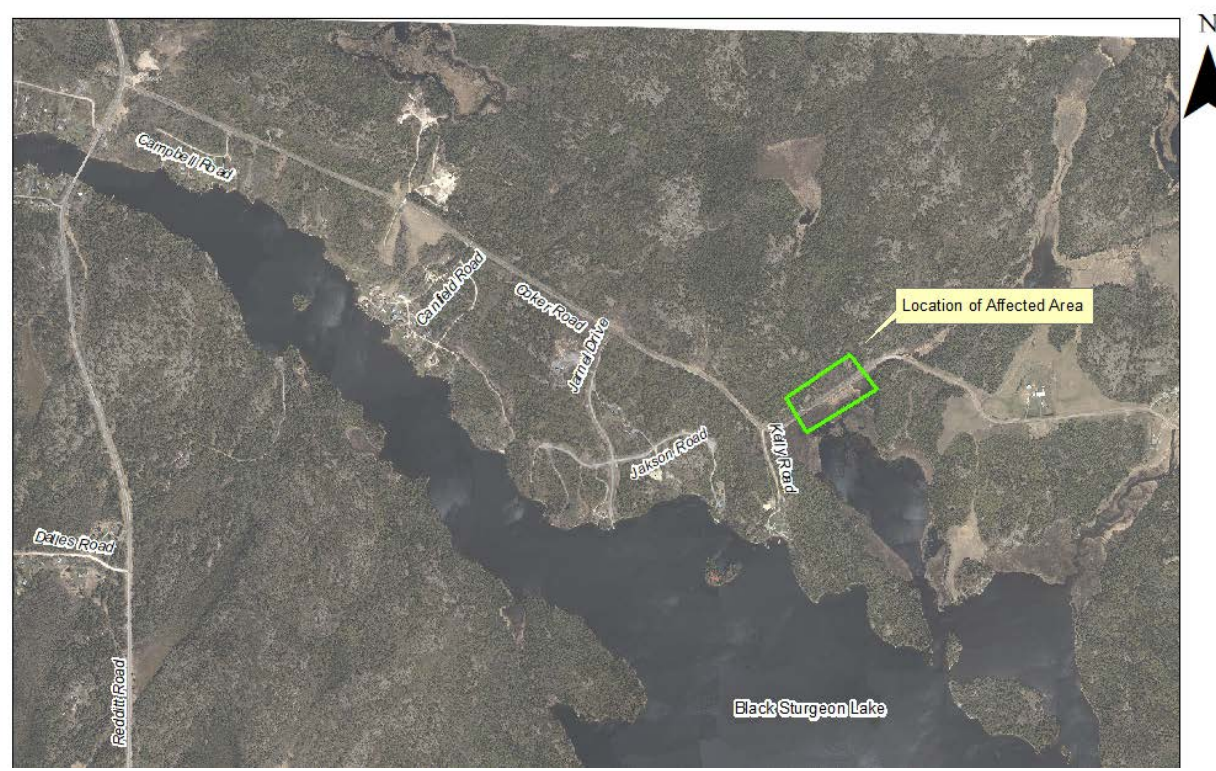
Figure 1: Coker Road Location Plan

Figure 1 below displays the location of the area affected by the flood waters and road closure.